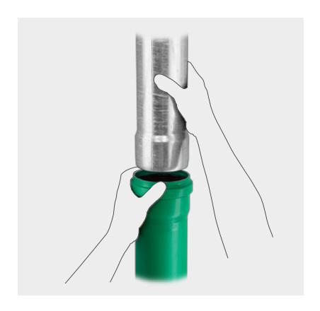
No need for connector

The GRÖMO standpipe ensures fluid transitions. As a fixed component in roof drainage, the standpipe provides protection against damage in areas prone to impact. Particularly smart: The perfectly fitting transition from rainwater downpipe to standpipe makes the standpipe cap unnecessary. The built-in seal provides support and keeps the two pipes perfectly centered. There's more space to move for cleaning thanks to the standpipe's large cleaning opening (optional).